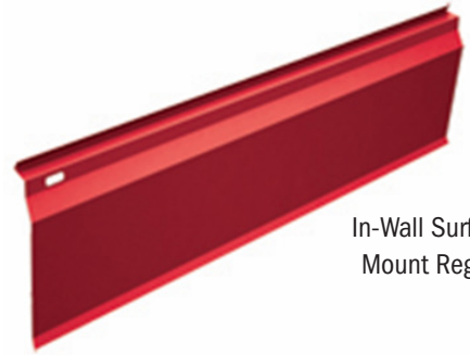
In-Wall Surface Mount Reglet